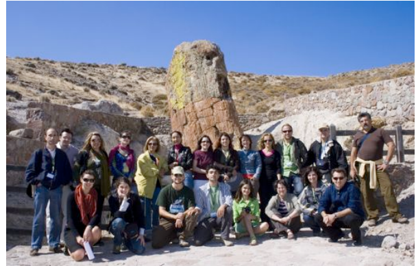
Participants of the Intensive Course "Geoconservation and Geoparks: Interpretation and Communication" in front of a gigantic petrified trunk in the Lesvos Petrified Forest, (Greece).

A new Intensive course "Geodiversity and Geological Heritage Assessment" is organised in 2009. It will take place in Portugal (University of Minho, Braga), from 9-13 September 2009.