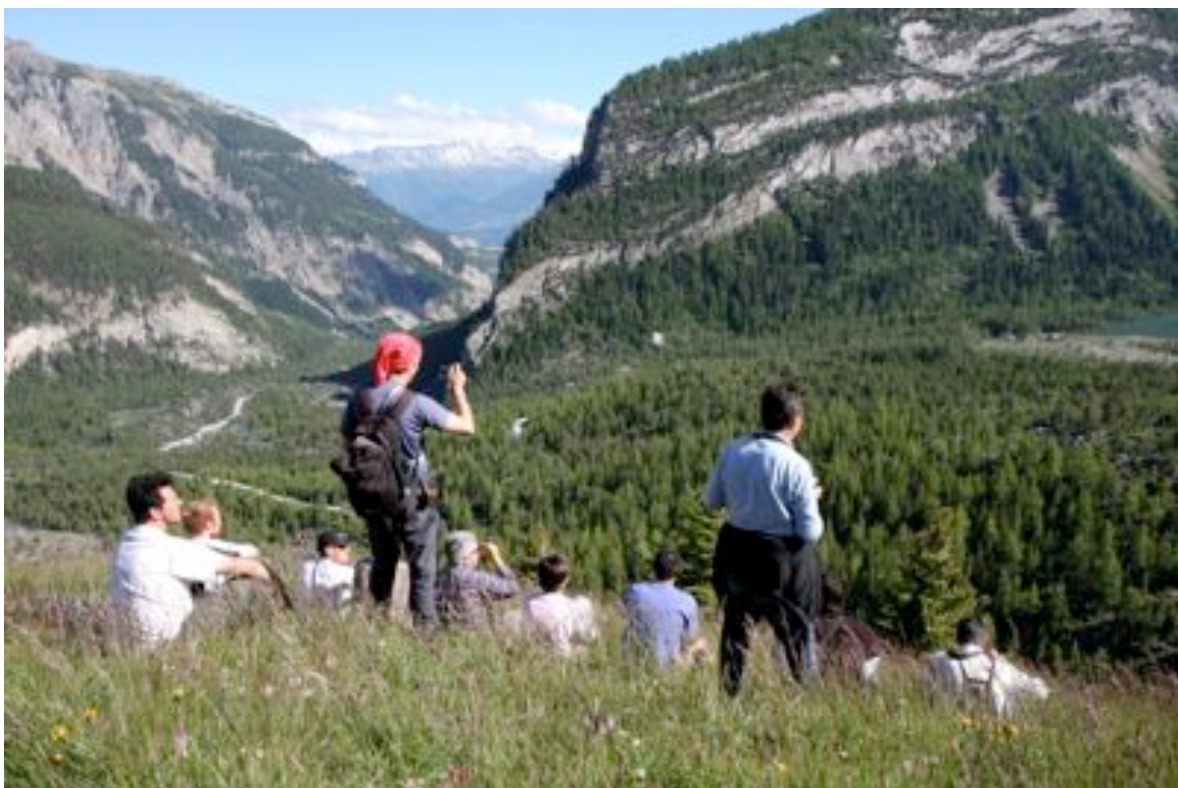
Participants of the workshop "Mapping Geoheritage" admiring Lake Derborence (Valais, Switzerland) at the end of a day of mapping.