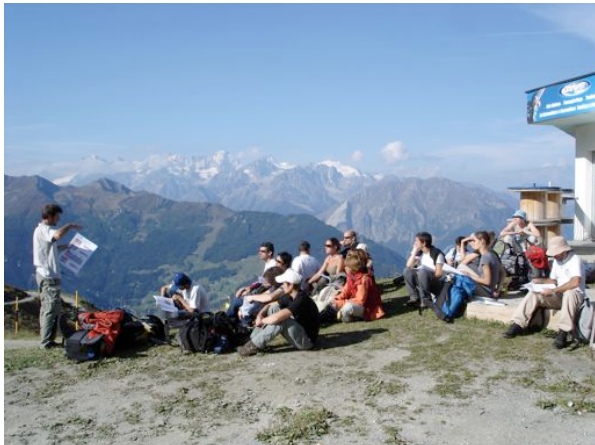
Participants and Staff from the intensive course "Geomorphosites and Landscape" during the field-trip in Val de Bagnes (Switzerland).