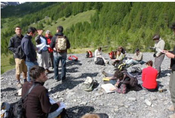
Participants of the workshop “ Mapping Geoheritage ” during a mapping exercise in the field.