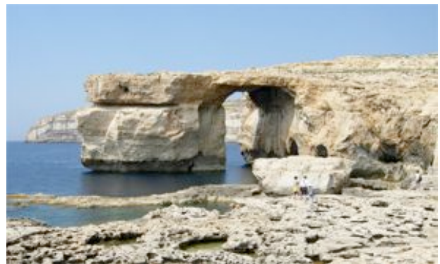
One of the geomorphosites visited during the field trip on the Gozo island (Italo-Maltese Conference).