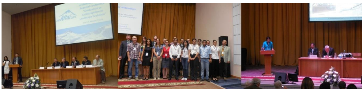
Pictures during the Regional Conference in Altai State University, Barnaul

At the 3 rd day of that conference I had my oral presentation on the topic of “Anthropogenic Impacts on the Morphology of the Haora River, Tripura, India” in the ‘Human Aspects on Geomorphology’ session. I found that a quite impressive number of renowned Geomorphologists as well as promising scholars were attending that session. I had received one question came from the audience related to the time period which I have considered for analyzing the problem. I have replied the questions satisfactorily and they were convinced. I had attained several other sessions like ‘Geomorphological Hazards and Cataclysmic Events, past and Present’, ‘Gradualism and Catastrophism in Tectonic Geomorphology’, ‘Extreme Events and Gradual Change in Process Geomorphology’, ‘Geomorphological Techniques’ etc. I listened several oral session as well as posters and I received a huge knowledge in several disciplines of geomorphology.