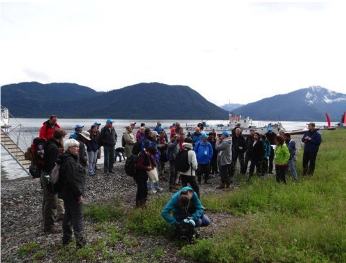
Explanation given by tutor to participants of Field Trip at Teletskoye Lake