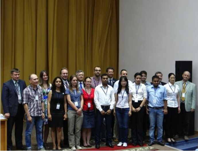
An Introduction of Young Geomorphologists at the Conference Opening

committee of the IAG Regional Conference and Post-conference Field-trip and Intensive Course in the Altai Mountains. I beg to pardon me if I have failed to mention the names unknowingly. I am grateful to International Association of Geomorphologists (IAG) and International Union for Quaternary Research (INQUA) for granting financial support to attend the Conference and to participate in the Post-conference Field Trip and Intensive Course for Young Geomorphologists in the Altai Mountains. The Conference and the Post-conference Field Trip were academically rewarding and socially enjoyable for me. I shall cherish the memories throughout my life and endeavour to do the best in the field of Geomorphology.