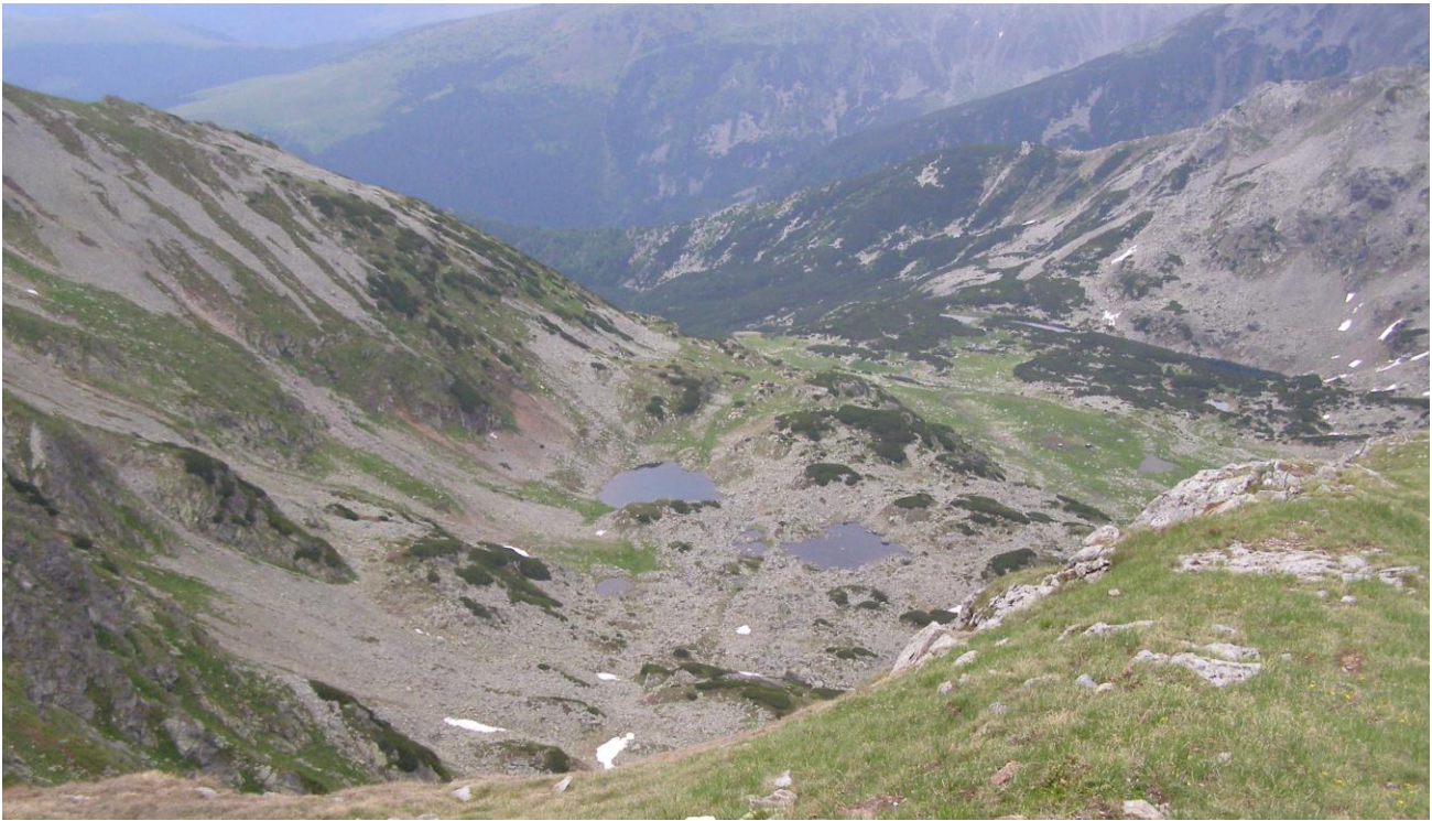
Mija glacial valley, view on the NE-direction from Cârja Peak