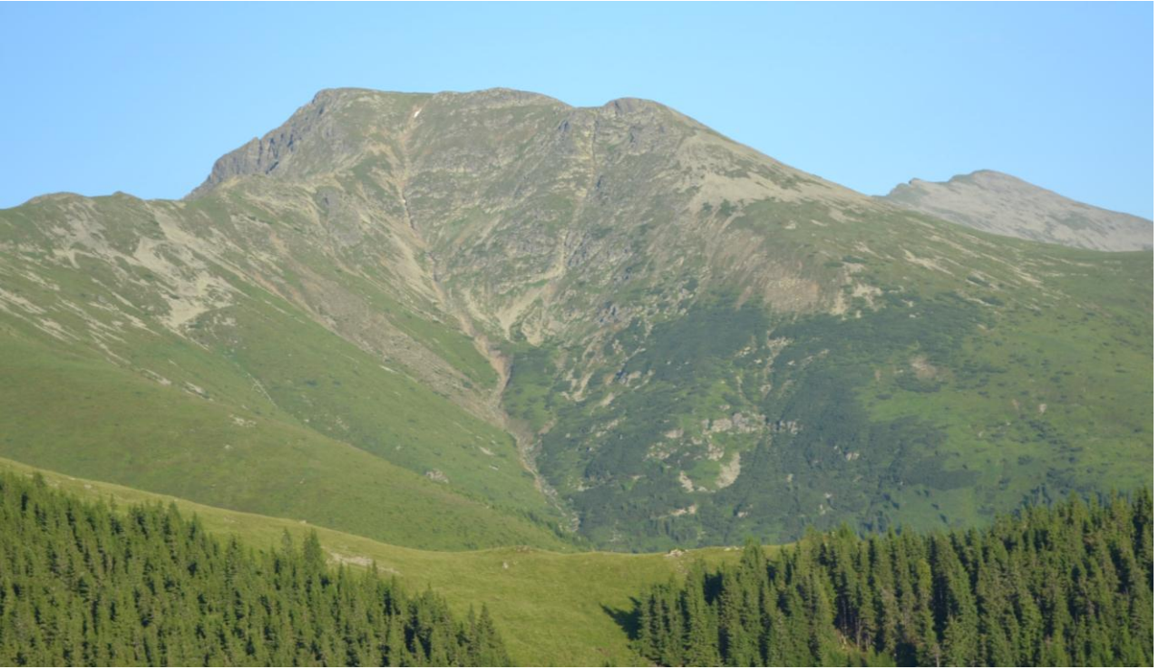
W-oriented slopes below Cârja Peak (2405 m a.s.l.) with vegetation cover affected by debris flow and snow avalanche activity