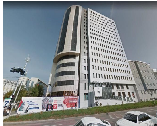
Block "B" UB GRAND HOTEL