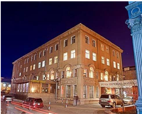
Block "A" PUMA IMPERIAL HOTEL

The Organizing Committee will reserve rooms for Workshop participants on their request and also you will contact directly with the PUMA IMPERIAL HOTEL . Block "A" is old one "B" is new one and just now named UB GRAND HOTEL . Prices are similar.