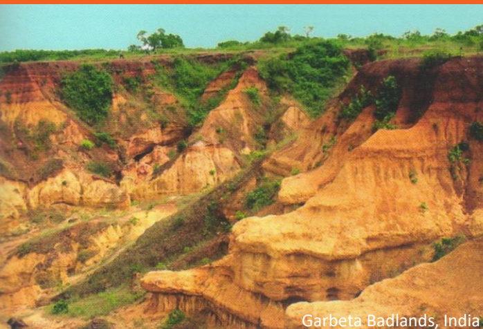
Garbeta Badlands, India