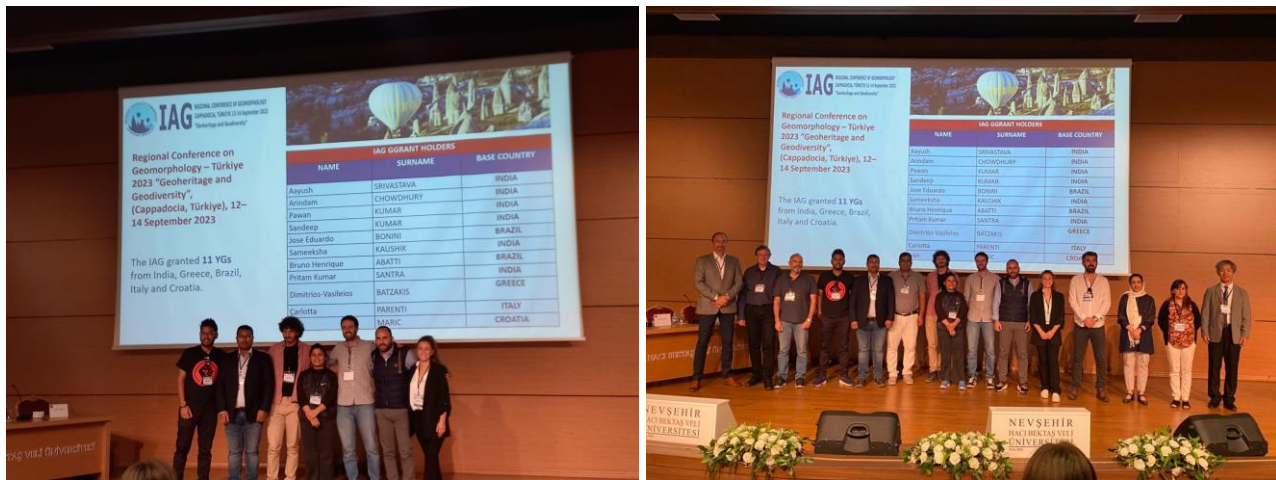
Figure 1: IAG granted Young Geomorphologists.