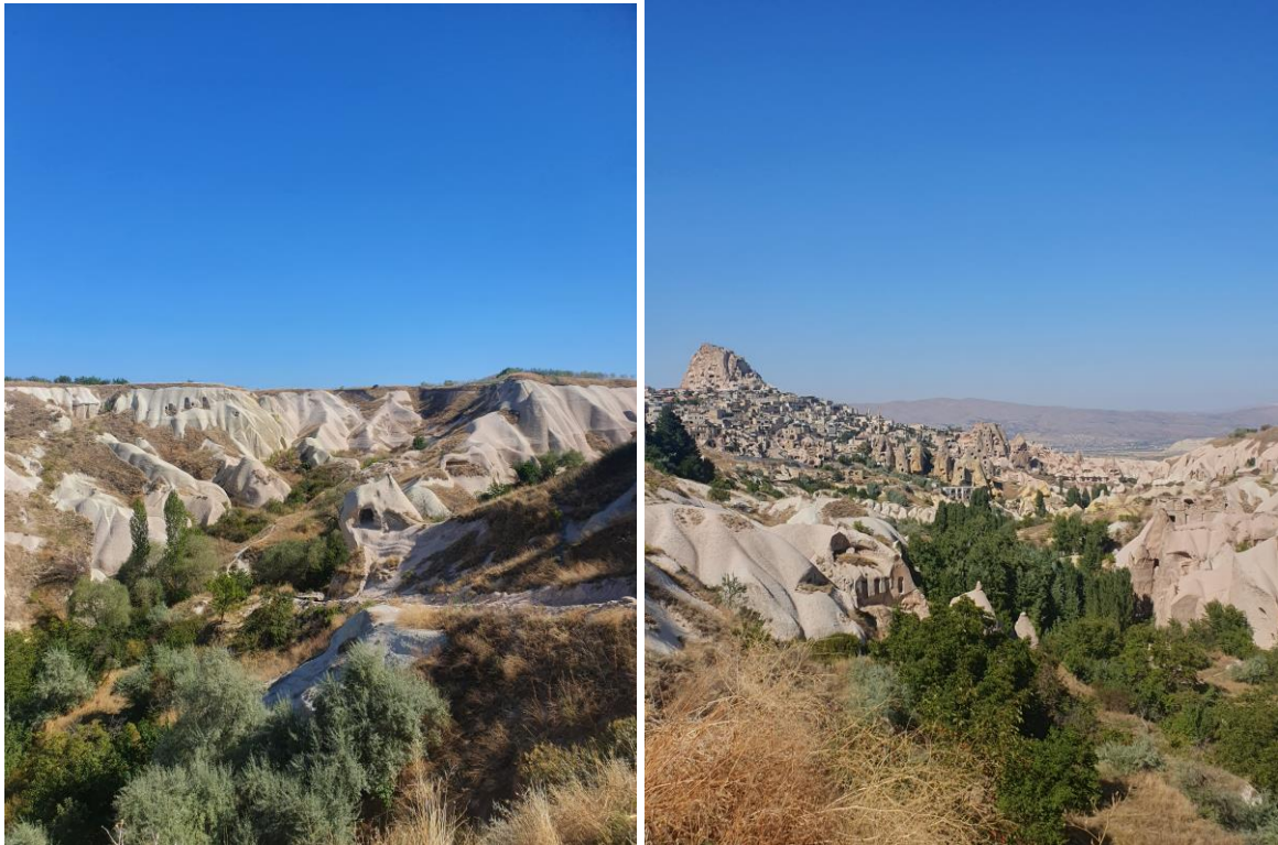
Figure 5: Pigeon Valley.

International Association of Geomorphologists