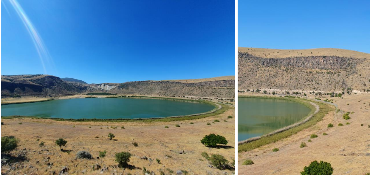
Figure 3: Narligöl Crater Lake.

International Association of Geomorphologists