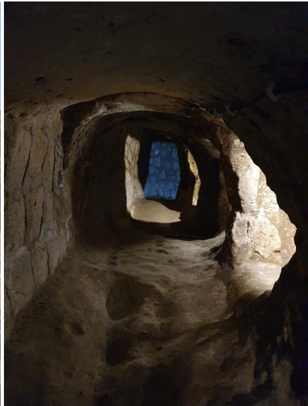
Figure 4: Derinkuyu Underground City.