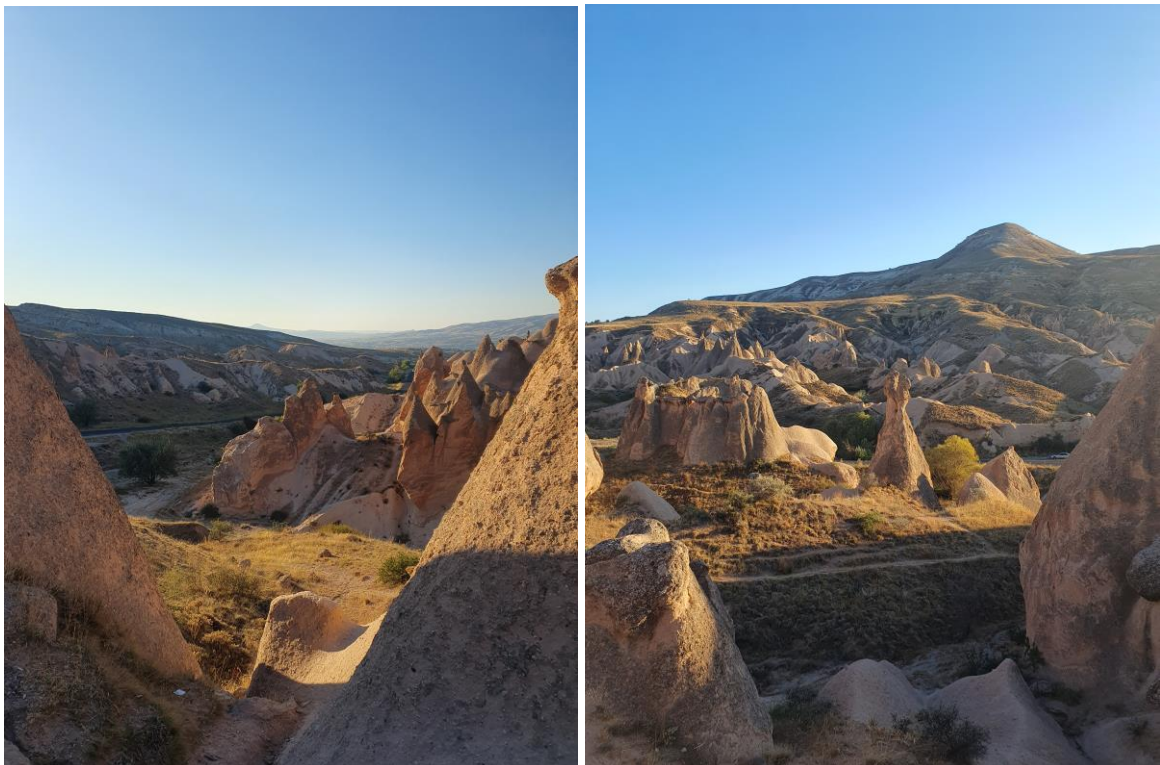
Figure 6: Imagination Valley.