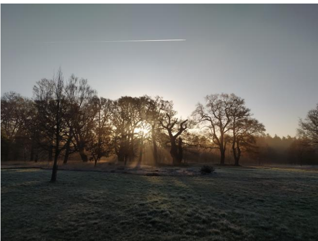
Morning walk in the beautiful surroundings