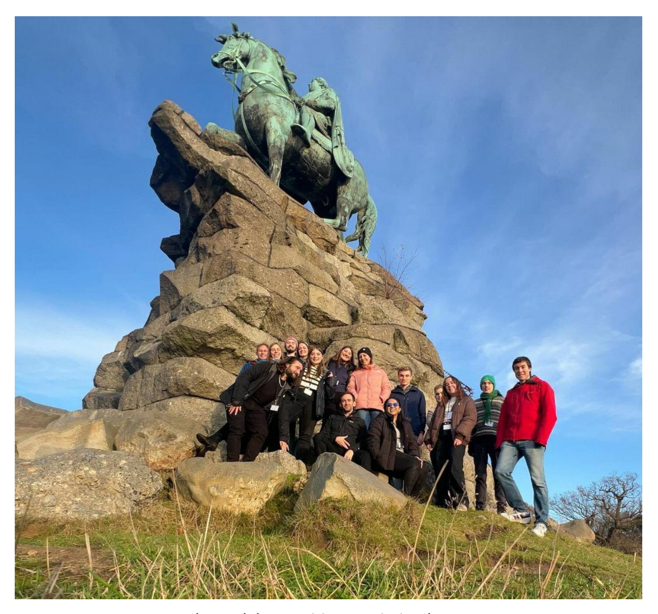
The Workshop participants enjoying the sun