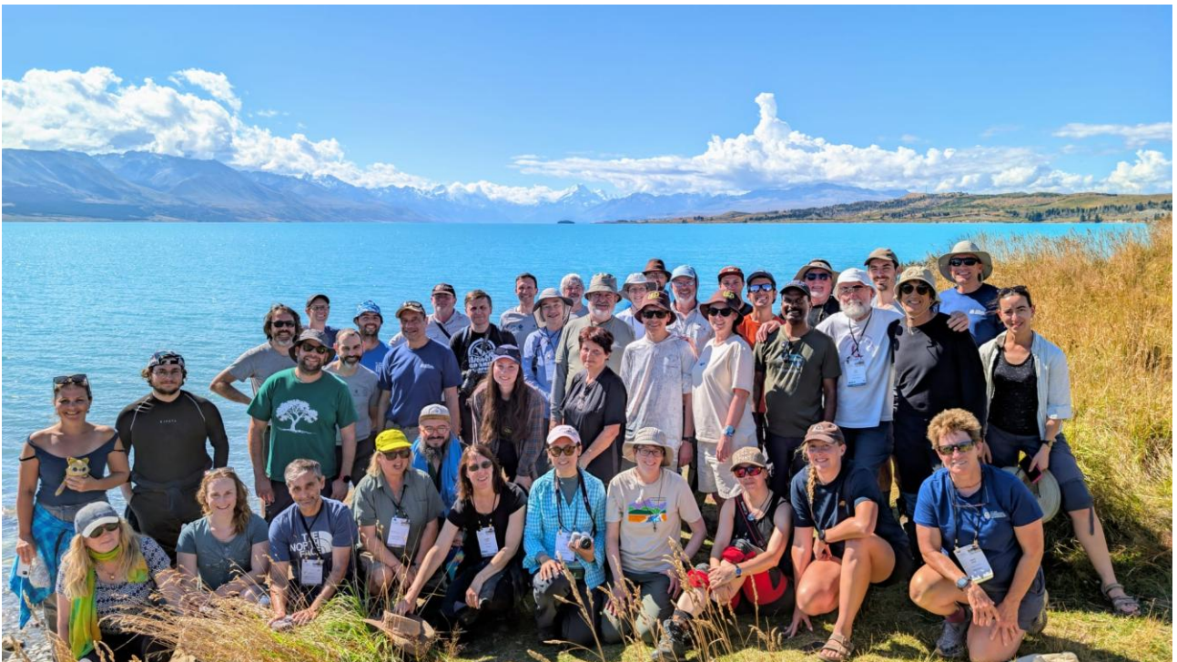
Figure 4. The post-conference field trip group on Day 5 at Lake Pukaki, with a view of Aoraki/Mt. Cook in the background.

Post-conference field trip (Geomorphology of the New Zealand Southern Alps): This 6-day trip took us on a loop starting from Christchurch to Hokitika, down the west coast, south through the mountains to Queenstown, north through the mountains to Aoraki, and back east to Christchurch. Highlights included seeing even more examples of lakes with unusual shapes and origins due to New Zealand's tectonic and glacial history, viewing glaciers and getting a visceral sense for how rapidly they are retreating, and appreciating the many insights that can be obtained from studying soil.