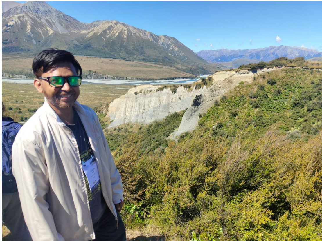
Figure 3: Field observation of sequential Quaternary glaciogenic deposits and lithological sections within the Waimakariri Valley, Southern Alps (4 th February, 2026).

International Association of Geomorphologists