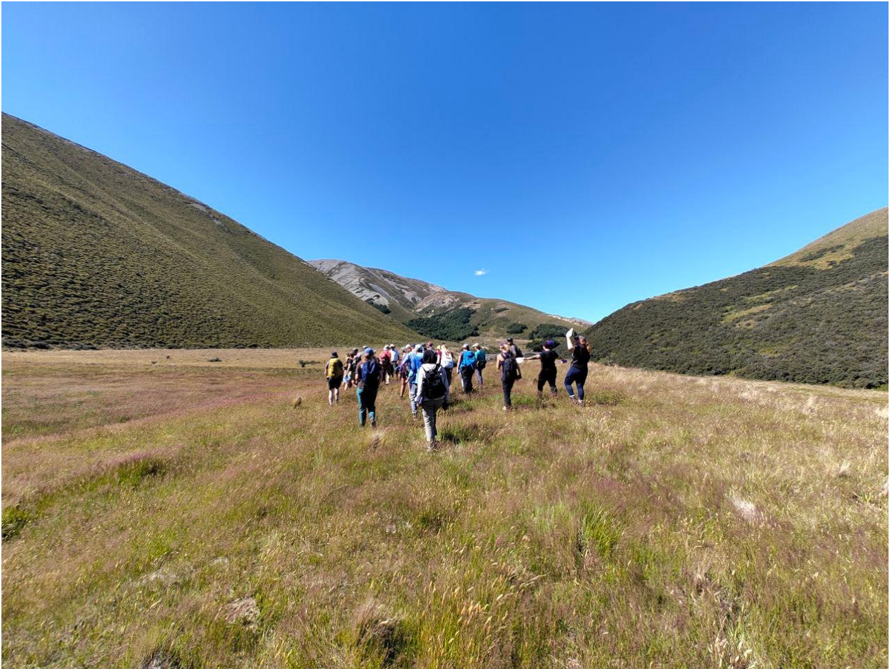
Figure 1: Field observations of glacial and tectonic landforms in the Southern Alps during the Cass Field Trip, 30 th January 2026.

I have delivered an oral presentation on the opening day of the conference (2 nd February 2026) entitled “ Assessing the effects of extensive bed material extraction on the granulometric and fluvial characteristics in a sub-Himalayan River in India ” as part of “ Session 03A: Learned lessons about anthropogenic drivers in the river evolution. ” In this presentation, I have discussed the geomorphic impacts of intensive in-channel bed material extraction in the Lower Balason River using surface grain-size analysis from 49 gravel bars and hydraulic modelling along a 25-km river reach. I have demonstrated spatial variability in transport- and supply-limited conditions, channel widening and incision, sediment fining, and increasing risks to riverine infrastructure. The presentation prompted valuable discussion on sediment connectivity, anthropogenic thresholds, and sustainable river management in mountain environments.